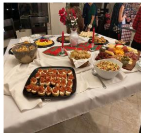
What a Spread!!