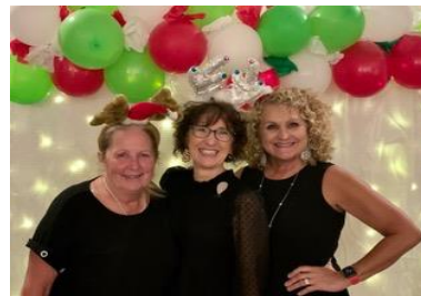
The Lovely "Jones" girls!

Please visit our Facebook page to check out more pictures from the evening and all our December events!