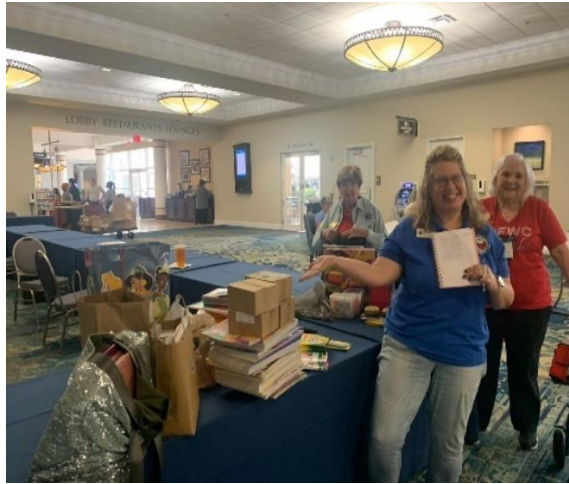
GFWC-WCNT's donations being logged in at the Collection Table!