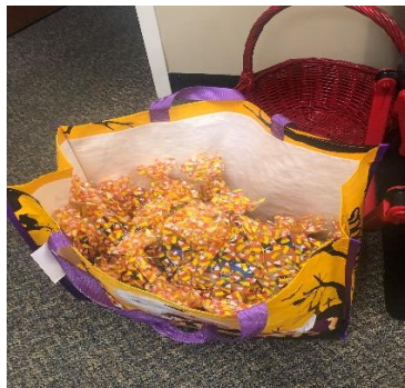
Halloween Gift Bags for Heart F.E.L.T. Kids, assembled at the September meeting, were delivered to St. James Methodist Church for distribution.