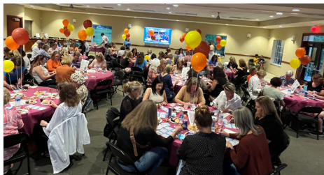
We had a packed house at our Bingo Fundraiser.

To order merchandise go to our vendor's website at GasperStitch.com and search New Tampa Womans Club for a full list of our apparel. They are located at 30225 Double Drive, Wesley Chapel. Don't want to pay shipping fees there is an option to choose pickup.